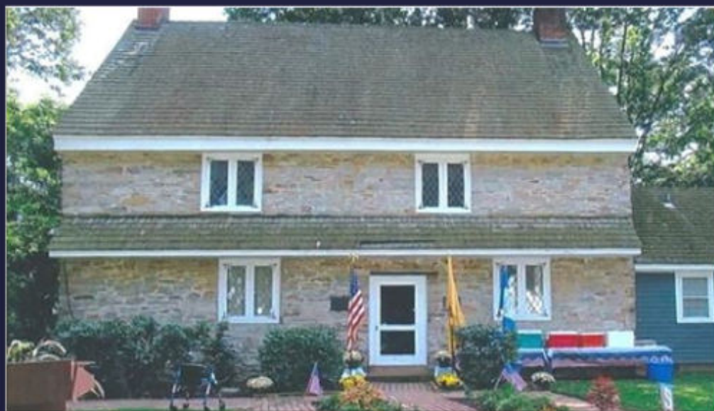
NJDAR Watson House